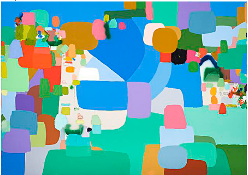
Federico Herrero, Paisaje con Letras, 2012, mixed media on canvas, Bridgette Mayer Gallery, Philadelphia, PA

an exhibition program designed to give recognition to five galleries representing artists who create outstanding video works. These works will be installed and screened in their own exhibition space. THINK BIG, a conceptual project focused on taking a big idea and turning it into a piece of art, is another not-to-be-missed special exhibition. The works produced for this project are expected to be bold and inventive, and will be set up in solo exhibition spaces.