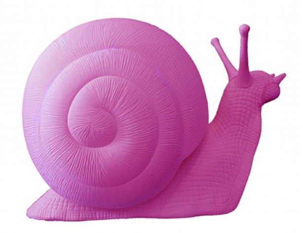
Cracking Art Group, Pink Snail, recycled/recyclable plastic, Galleria Ca'D'Oro, Rome, Italy

This year, there will be 190 galleries participating in the fair. To kick start the festivities, there will be an opening night reception benefiting the Perez Art Museum of Miami. This VIP event will give guests an exclusive preview of the works on display.