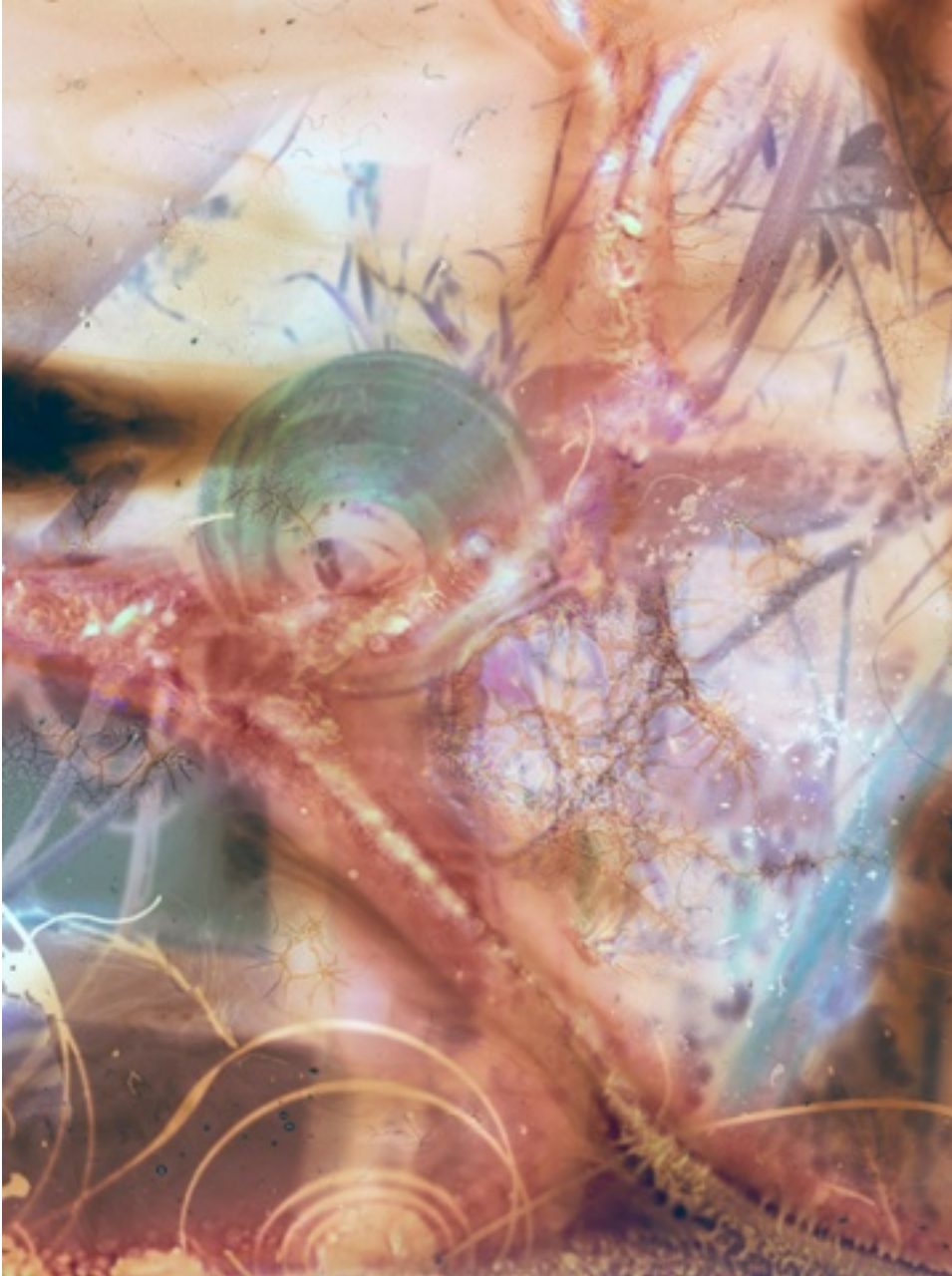
Rockstar Sugar Free #2