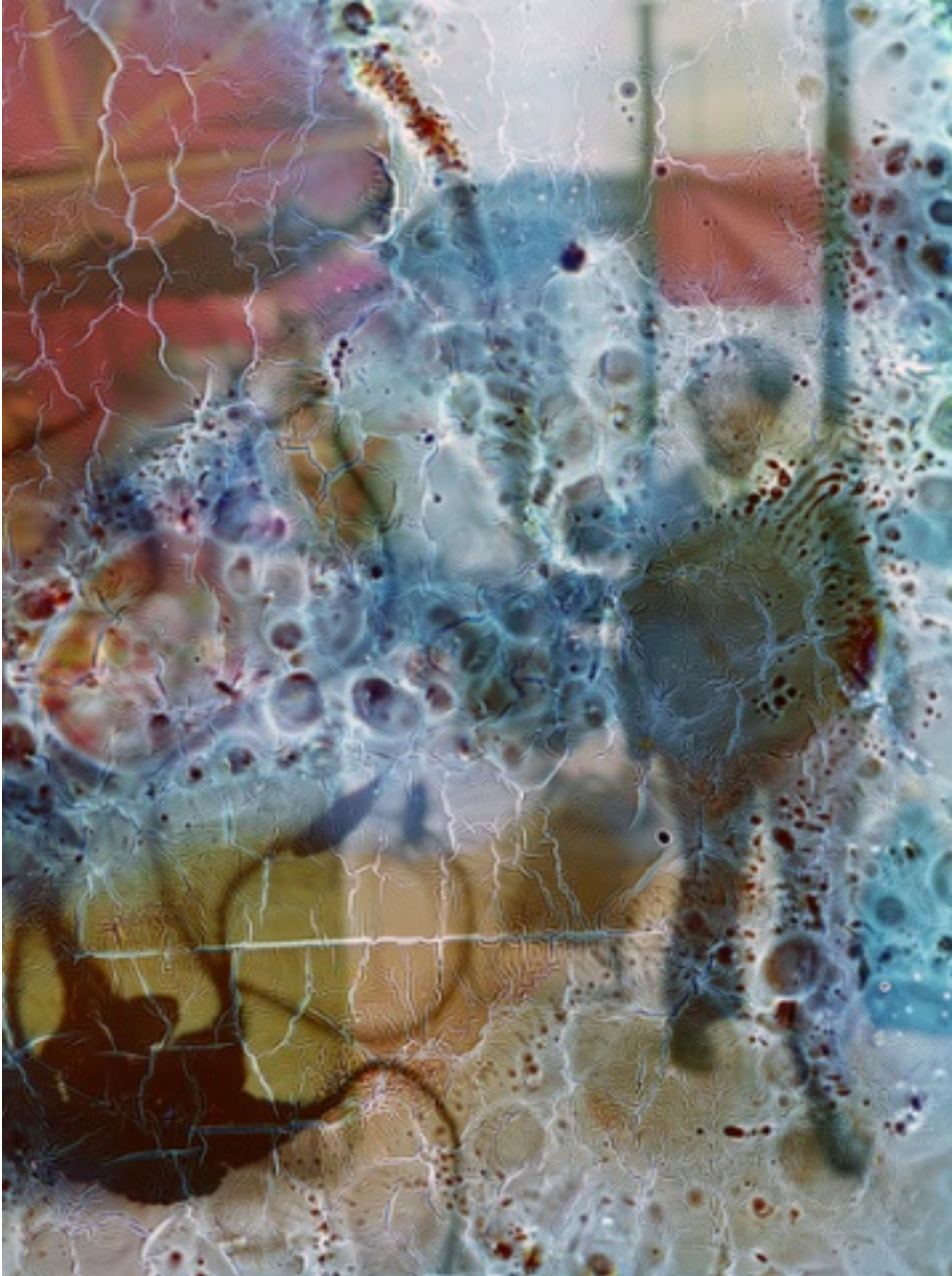
Shark Stimulation 2