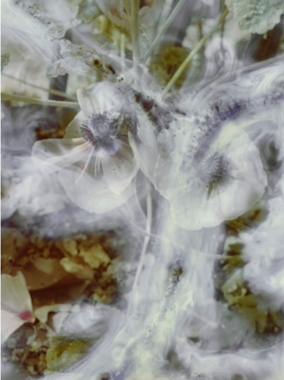
Rock Star Sugar Free