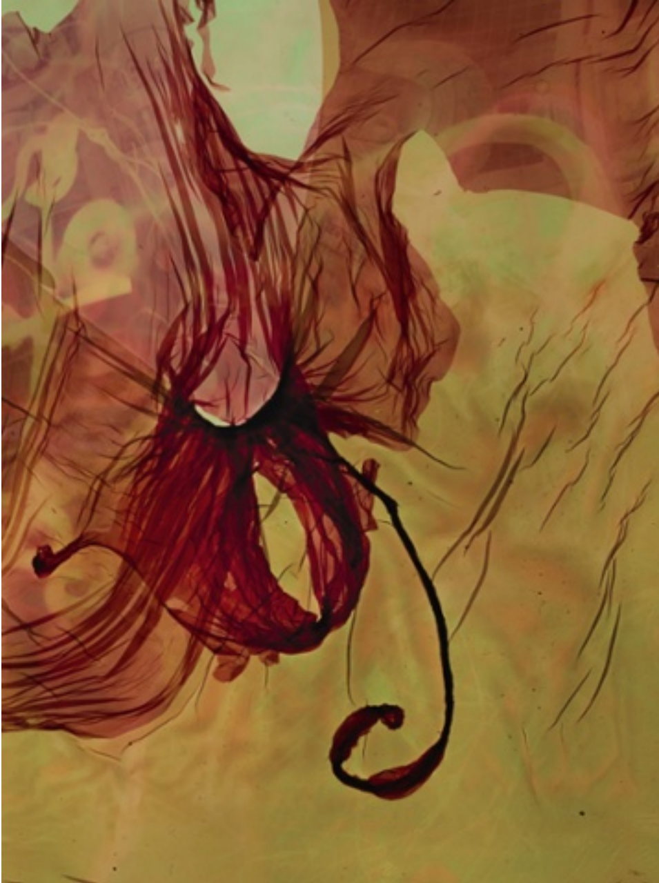
Organic Energy #2