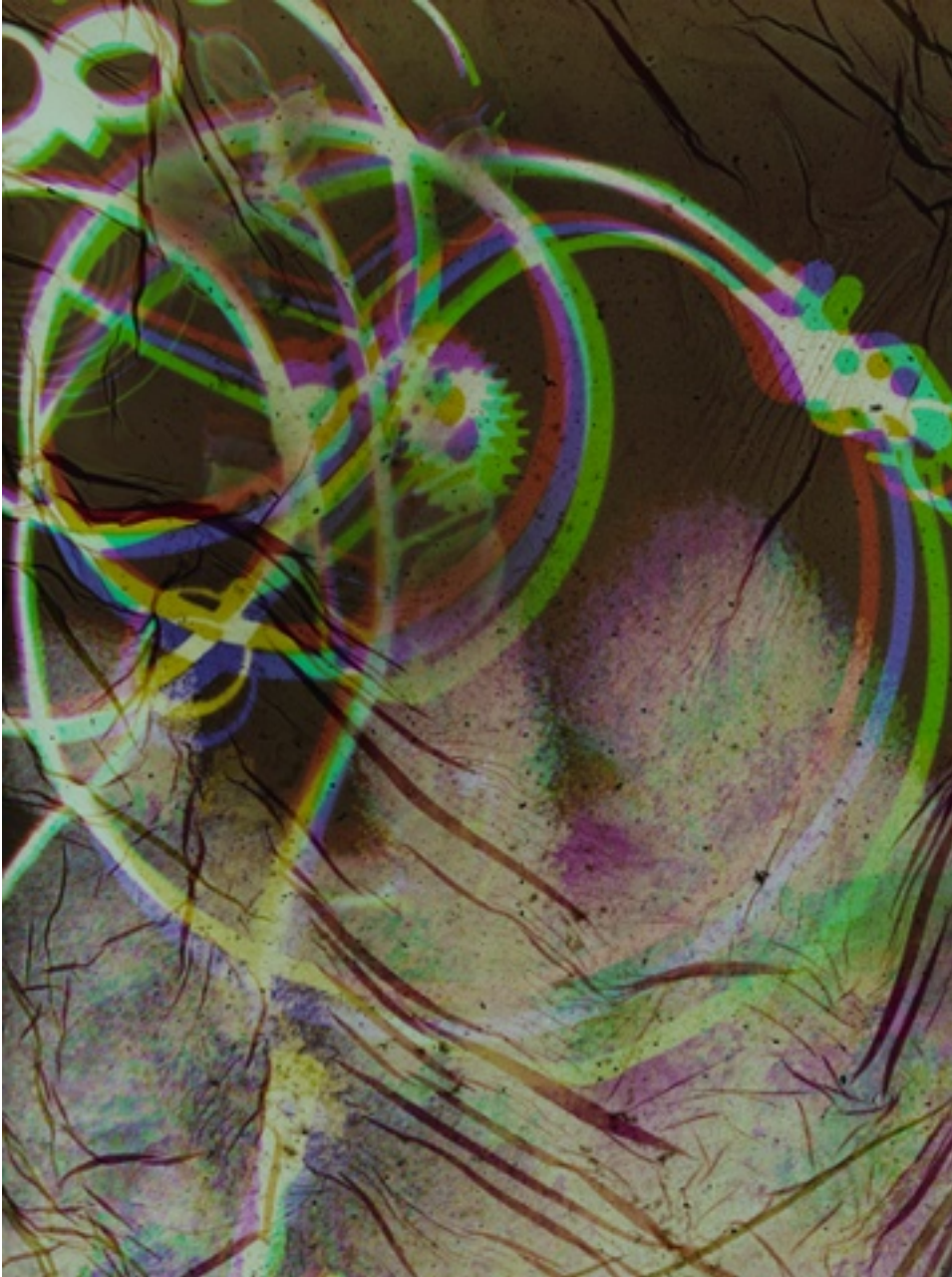
Survive and Revive